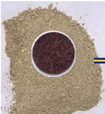
Wild pennycress 5

Combining NGTs with decades of scientific knowledge on Arabidopsis (a model plant closely related to pennycress), breeders were able to precisely target six genes of pennycress, thereby developing a new crop: CoverCress* .