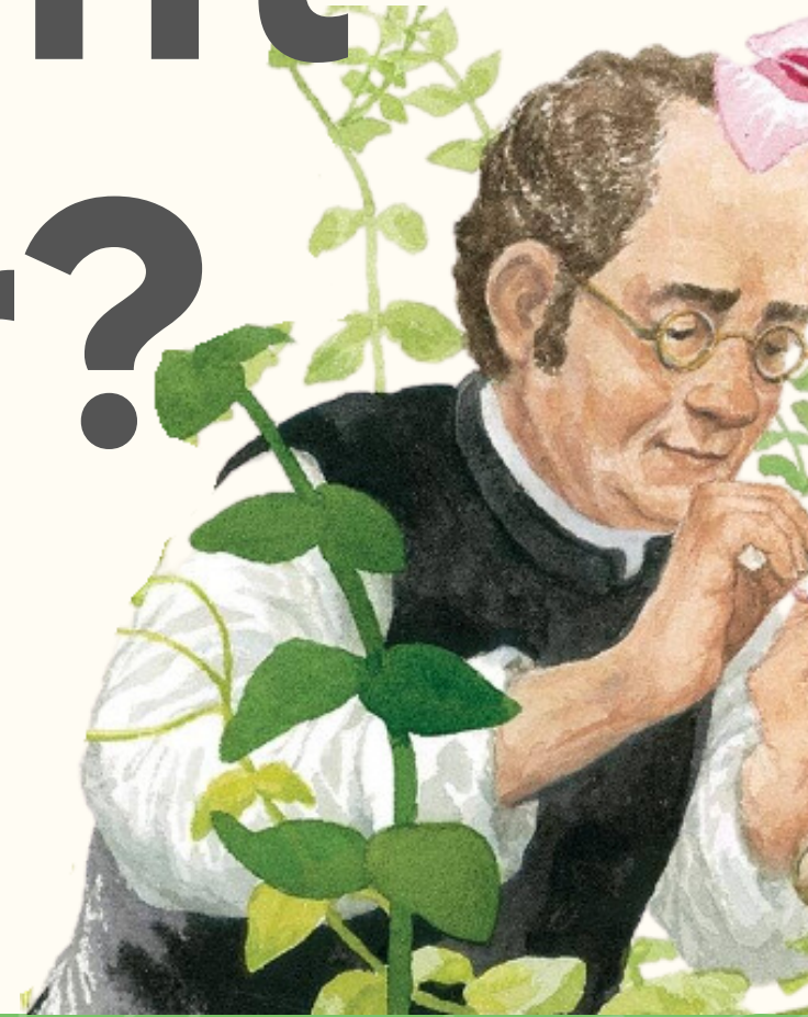
Mendel